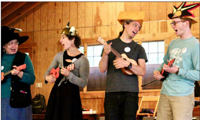
Swing Into Summer 2019.