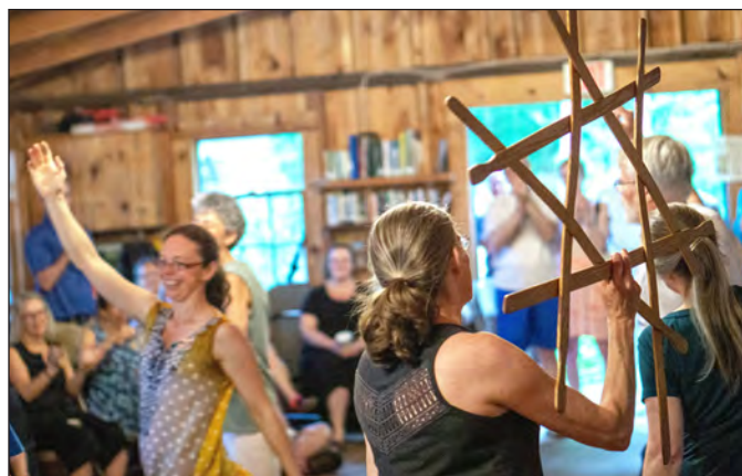
2019 July 4th Weekend at Pinewoods.

http://www.facone.org/ calendars-folk-dancing-in-new-england, www.contradancelinks.com, or https://www.cdss.org/community/events-calendar/