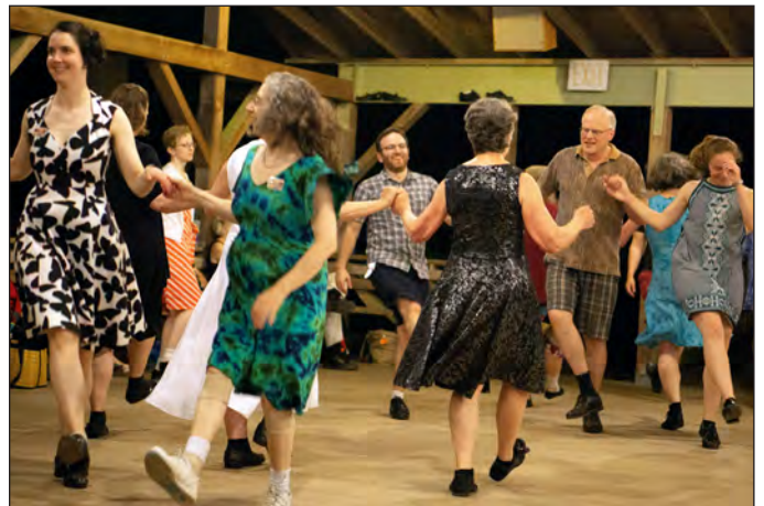
2019 July 4th Weekend.