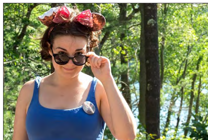
Will we see YOU at Labor Day this year?

Registration is open now! For more information, visit: www.facone.org/labor-day-weekend/labor-day-weekend