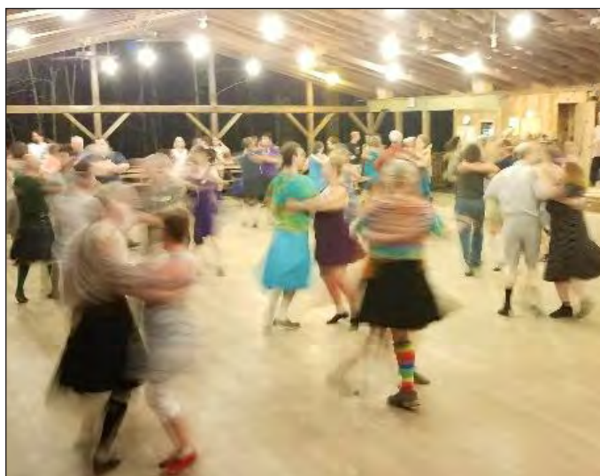
ESCAPE 2019.