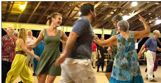
Labor Day Weekend 2019.