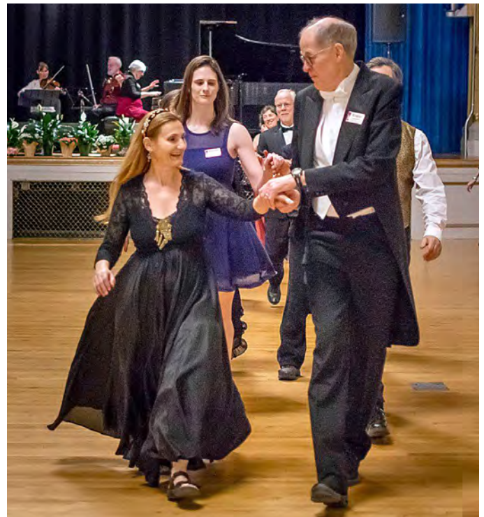
2019 Playford Ball.