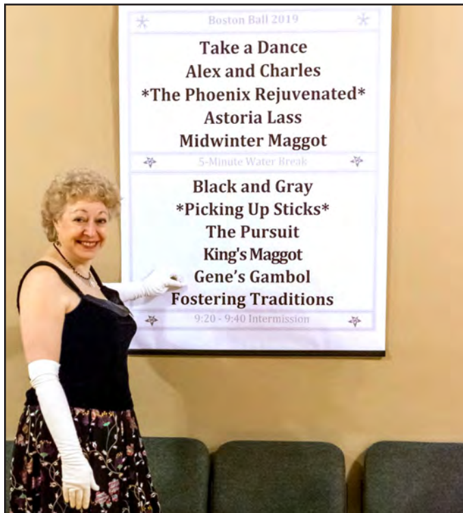
2019 Playford Ball.

Saturday, March 2nd at Nevins Hall, Framingham