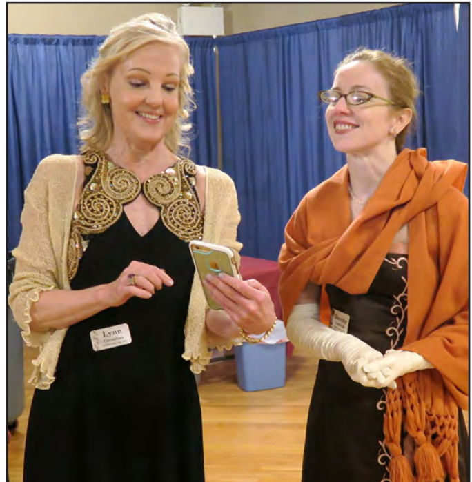
2019 Playford Ball.

Mostly Waltz for Boston, Concord Scout House, 74 Walden Street, Concord, MA. Waltzes & other couple dances. 2-5:30pm selected Sundays, Admission $12; Folk Arts Center members $10; Young adults $6. Your second time attending Mostly Waltz is FREE! Beginners, experienced dancers, singles, and couples are all welcome! Info: www.facone.org/programs/mostlywaltz.html