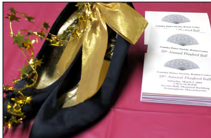
2019 Playford Ball.