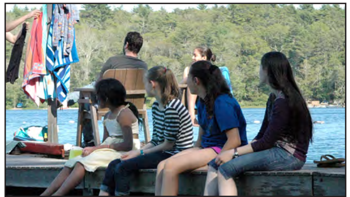
Labor Day at Pinewoods.