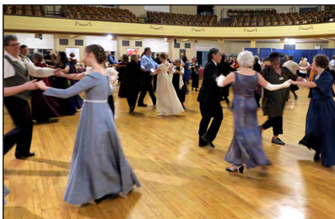
2019 Playford Ball.