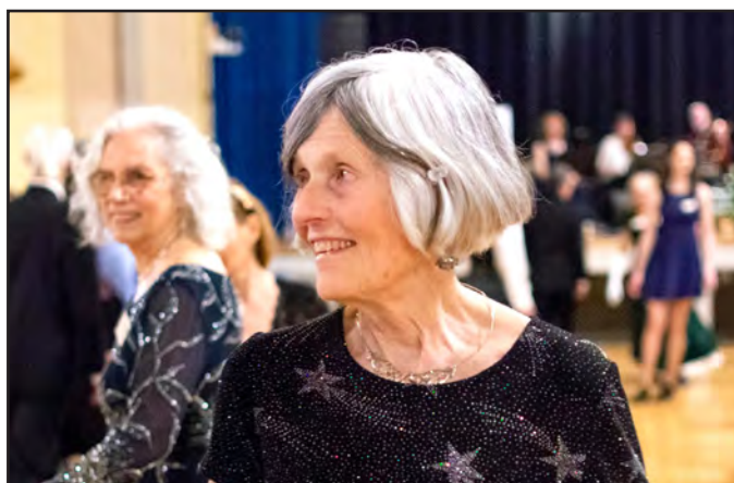
2019 Playford Ball.