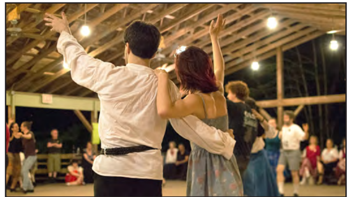
Labor Day at Pinewoods.