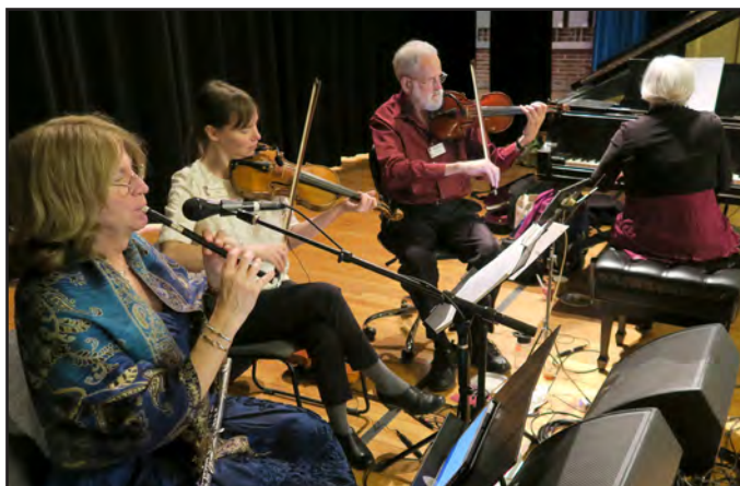
2019 Playford Ball.