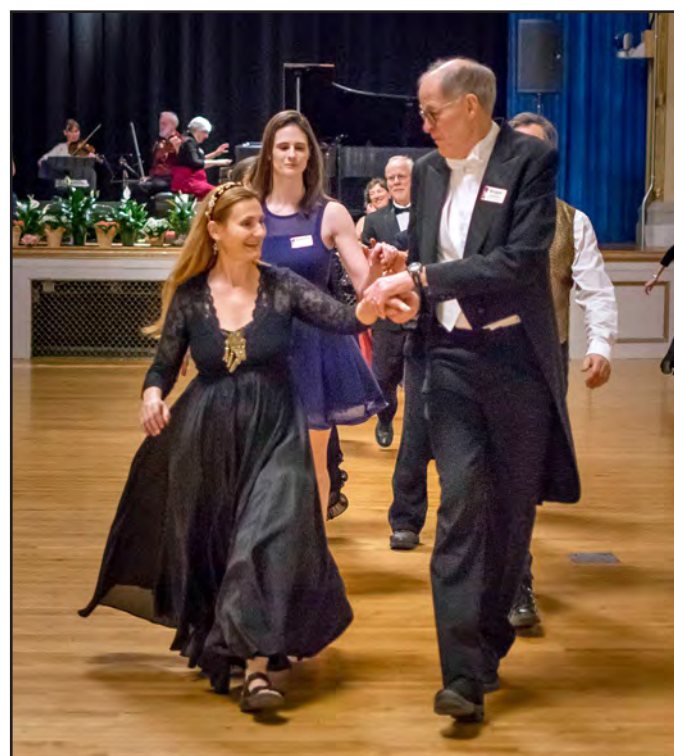
2019 Playford Ball.