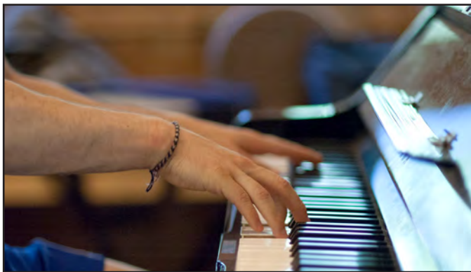
Labor Day at Pinewoods.

Details: http://www.facone.org/labor-day-weekend/labor-day-weekend.html