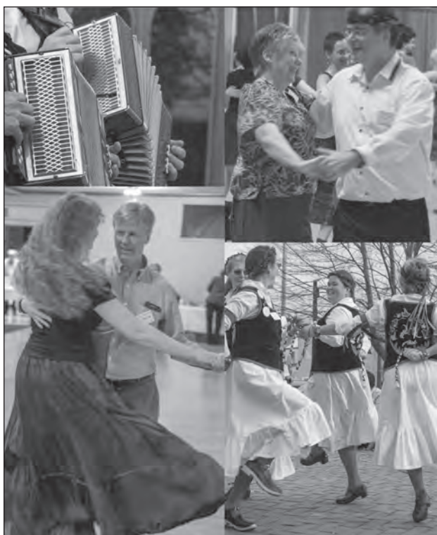
Scenes from CDS Boston Centre's 100th Anniversary Gala Celebration

For more information please see the flyer in this newsletter and online at www.cds-boston.org .